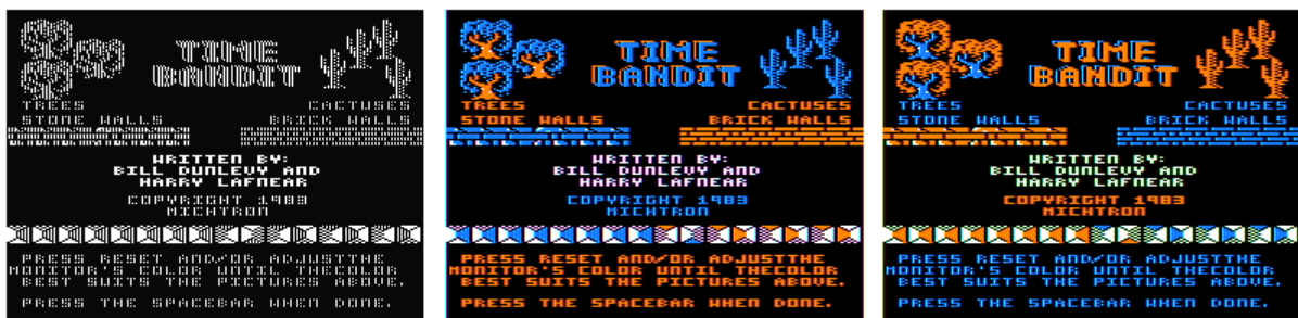
Figure 5.2: Time Bandit , Dunlevy & Lafnear, 1983 in different artifact modes

Try pressing Ctrl+A one or more times. What this really means is that you’re used to running the program on an NTSC machine, and it makes use of cross-colour, but XRoar is emulating a PAL machine. Try starting with -default-machine tano or -default-machine cocous .