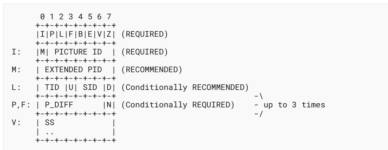
Figure 2: Flexible Mode Format for VP9 Payload Descriptor

In flexible mode (with the F bit below set to one), the first octets after the RTP header are the VP9 payload descriptor, with the following structure.