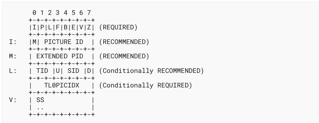
Figure 3: Non-Flexible Mode Format for VP9 Payload Descriptor

Except as noted, the following field descriptions apply to the payload descriptor formats in both Figures 2 and 3.