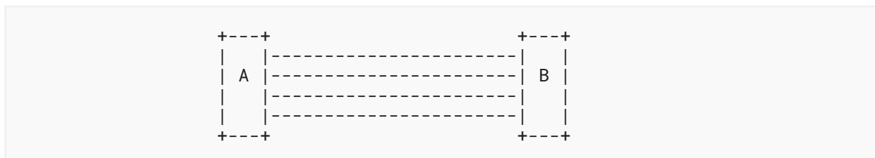
Figure 1: Performance Measurement on a LAG

This document addresses the scenario where a LAG directly connects two nodes. An example of this is in Figure 1 , where the LAG consisting of four links connects nodes A and B. The goal is to measure the performance of each link of the LAG.