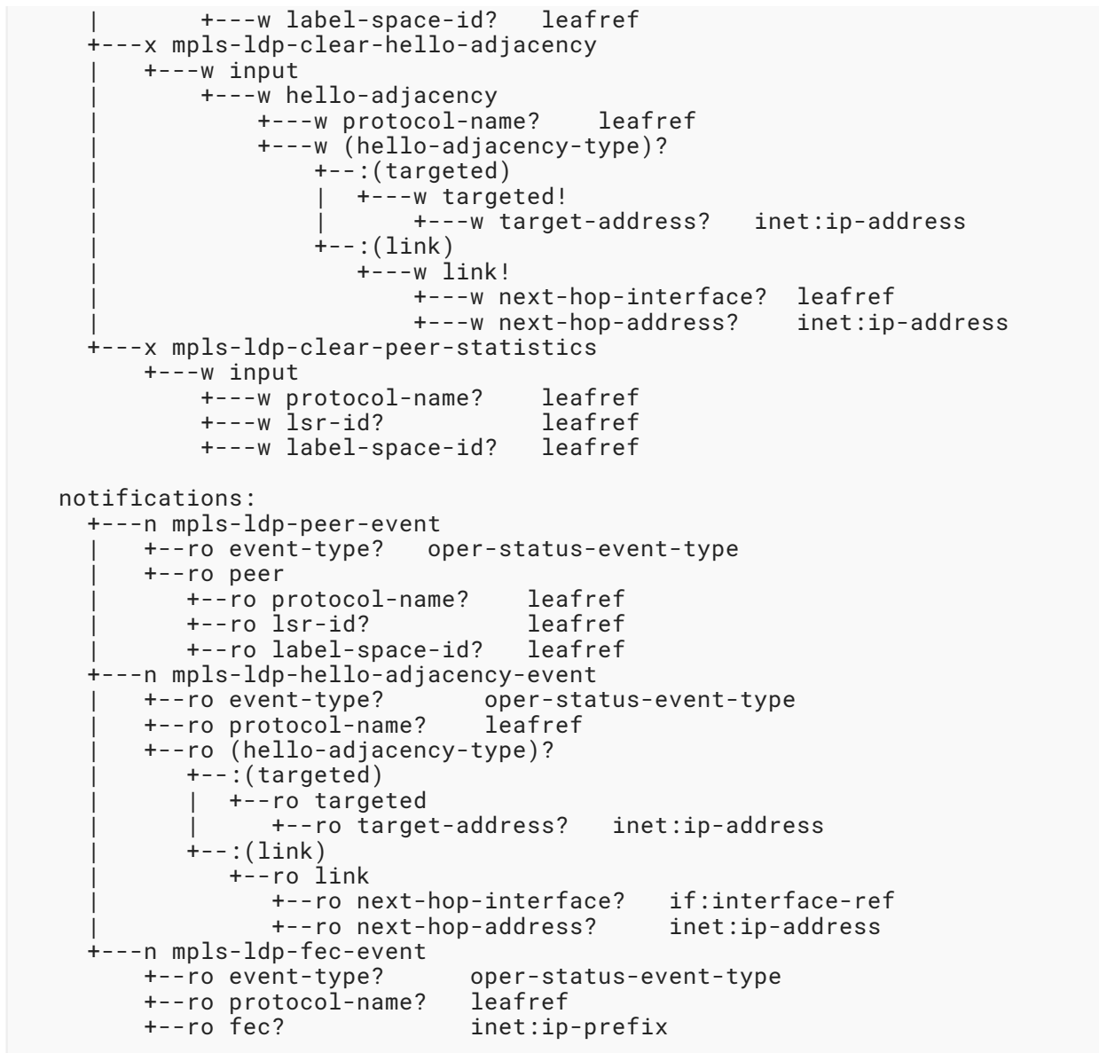
Figure 2: Complete Tree