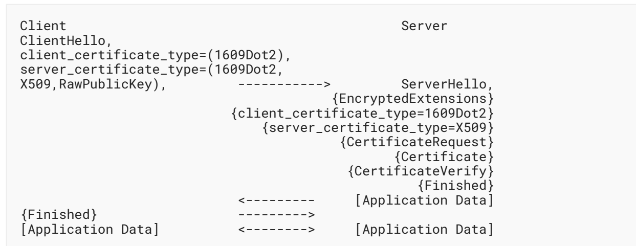
Figure 3: TLS Client Uses the ITS Certificate and TLS Server Uses the X.509 Certificate

This example shows the TLS authentication, where the TLS client populates the server_certificate_type extension with the X.509 certificate and raw public key type as presented in Figure 3 . The client indicates its ability to receive and validate an X.509 certificate from the server. The server chooses the X.509 certificate to make its authentication with the client. This is applicable in the case of a raw public key supported by the server.