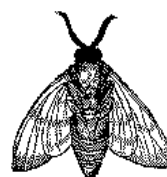
Figure 3. A sample black and white graphic that has been resized with the includegraphics command.

To set a wider table, which takes up the whole width of the page's live area, use the environment table* to enclose the table's contents and the table caption. As with a single-column table, this wide table will "float" to a location deemed more desirable. Immediately following this sentence is the point at which Table 2 is included in the input file; again, it is instructive to compare the placement of the table here with the table in the printed output of this document.